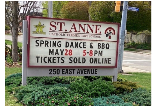
Figure 1: Proposed Sign Design